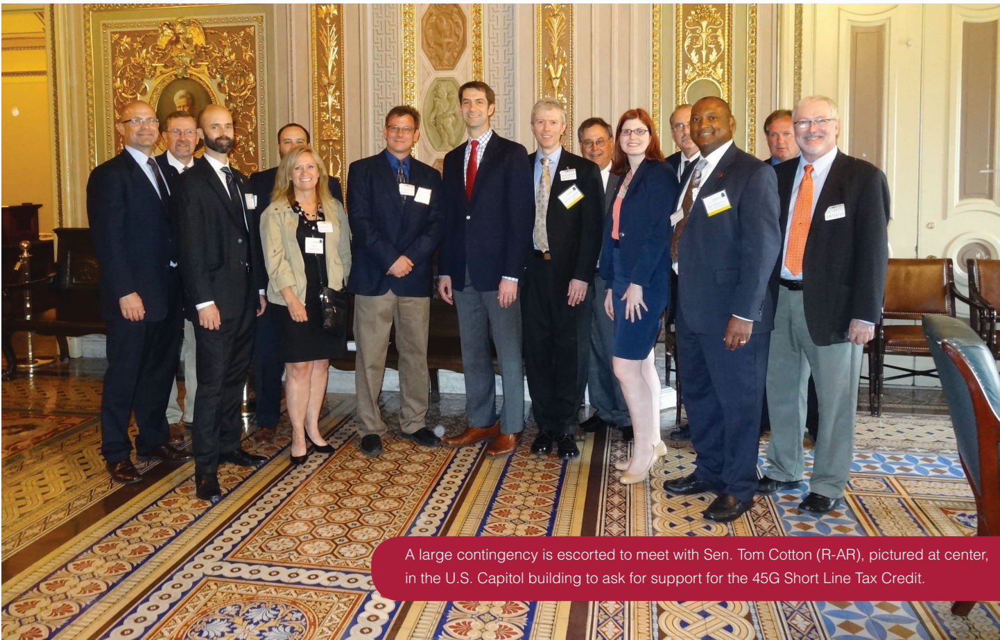
A large contingency is escorted to meet with Sen. Tom Cotton (R-AR), pictured at center, in the U.S. Capitol building to ask for support for the 45G Short Line Tax Credit.