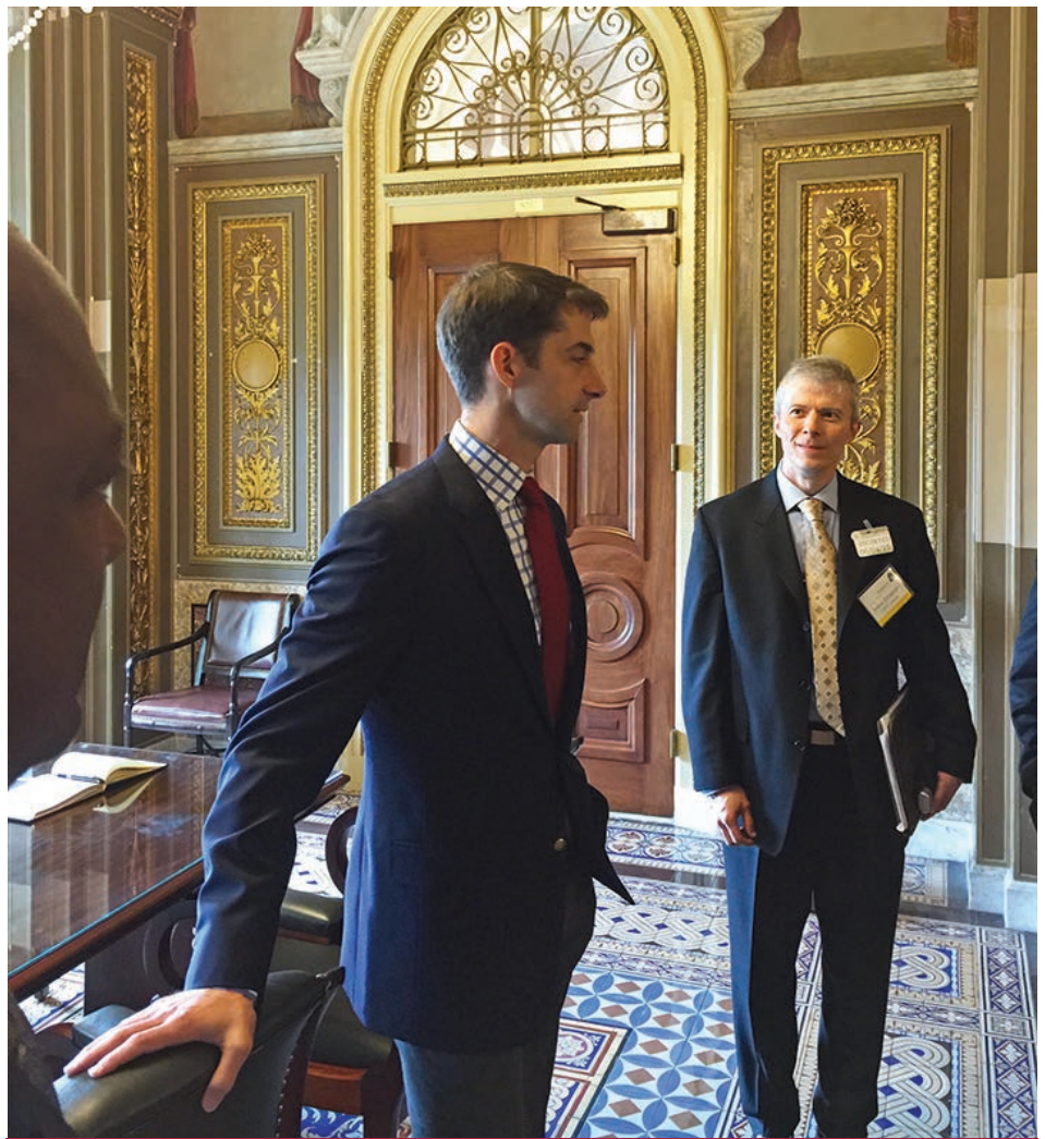
Sen. Tom Cotton (R-AR) speaks on railroad issues during the Railroad Day on Capitol Hill event

The Short Line Tax Credit leverages private sector investment in rail infrastructure by providing a tax credit of 50 cents for every dollar spent on track improvements. Another initiative discussed was keeping America’s freight railroads competitive by opposing any legislative effort that would adversely impact the economic and antitrust regulatory balance currently established under existing federal law. ■